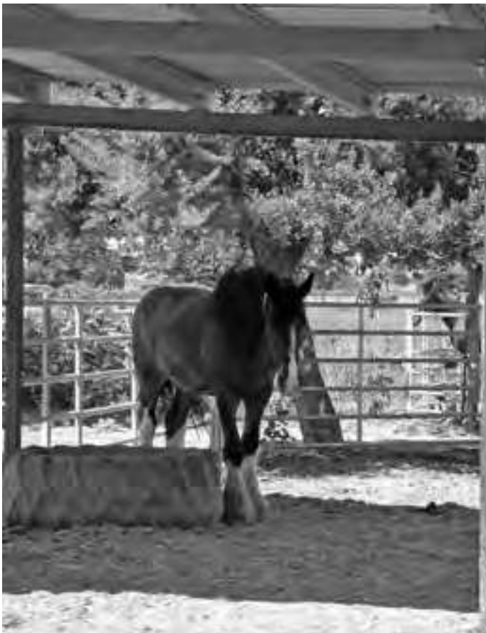
In areas of temperate winters and more days of heat and sunshine, simple pole and roof constructed shelters which protect from moderate rain and intensive heat may be preferable.

or electrical lighting supplied must be properly constructed and protected from the strains of horse manipulation and weather. If feed bunks are to be included in shelters, they should be of sufficient numbers or be large enough so that all horses can feed at once and avoid aggressive behaviors between animals.