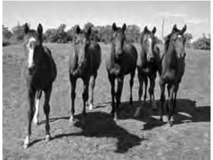
Horses develop strong social attachments to individual herd mates. Consequently, the grouping of individual hoses within pens, corrals, dry lots and pastures should be done with careful consideration.

aggressive behaviors such as fighting. All newly arrived horses should be quarantined (2-3 weeks) before mixing with resident horses. Before new horses are co-mingled, they can be exposed to the group by allowing an across-the-fence acquaintance period. All introductions of new individuals to each other regardless of group size should take place in daylight hours and under close supervision to avoid unnecessary harm or injury to horses.