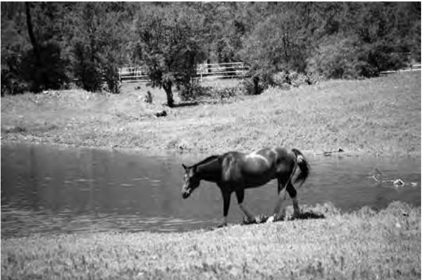
In general, it can be stated that equine sanctuaries must be assured of adequate supplies of clean and pure drinking water. If wells are the source of water, their capacity to deliver sufficient quantities of high quality water throughout the year must be assured.

While some sanctuaries may maintain their own water supply through on-site wells, the water needs and quality for most sanctuaries will be dictated by local governmental agencies. Similarly the means and methods for the control of water run-off and sewage release from sanctuary facilities will be dictated by the rules and regulations of local and state governments. In general, it can be stated that equine sanctuaries must be assured of adequate supplies of clean, pure drinking water. If wells are the source of water, their capacity to deliver sufficient quantities of high quality water throughout the year must be assured. Drainage