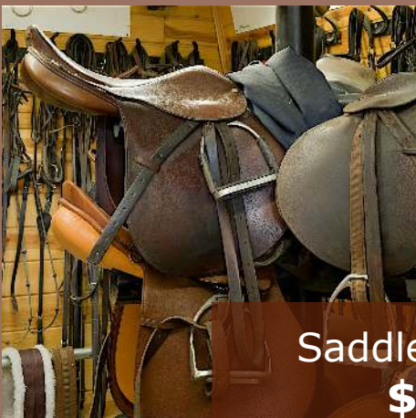
Saddlery & Goods $32 million annually