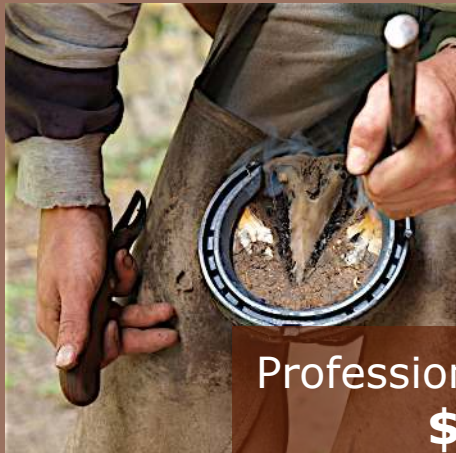
Professional Services $87.2 million