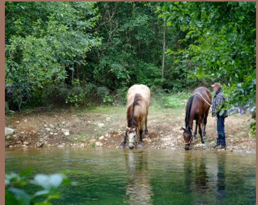
Tourism $26 million