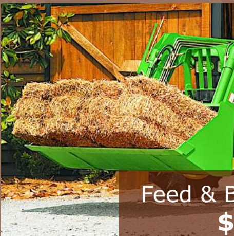
Feed & Bedding $125 million